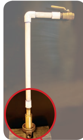
Quick Fill Pipe