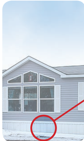
Homes without basements

Hydrant Site applications with a UNIVERSAL CHECK VALVE