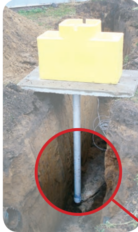
Livestock Watering System